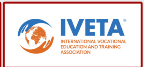
International Vocational Education and Training Association (IVETA)