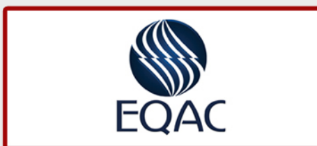
Education Quality Accreditation Commission (EQAC)